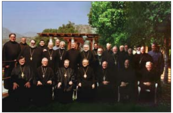
Clergy Retreat 2003: Clergy and Religious from Eparchy of Van Nuys gathered in Malibu, CA for an annual retreat at Serra Retreat Center from October 6-10.