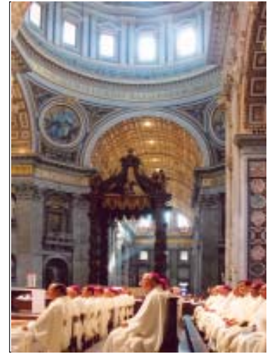
Bishops united in prayer at Basilica of St Peter, Rome