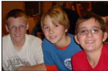
Teens share their faith at retreat.

The Winter retreat included an evening of bowling and a visit to the Phoenix Zoo to see “Zoolights.” This zoo event featured colored lights, illuminations, sounds and of course, the animals.