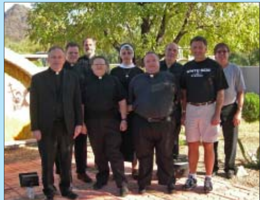
Intereparchial Youth and Young Adult Commission met in Phoenix on October 26. The commission is planning the 2006 Intereparchial Byzanteen Rally (July 20-23) in Emmitsburg, MD.