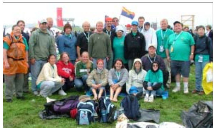
WYD 2005 pilgrims represented Byzantine Catholic Eparchies of Van Nuys, Parma, Passaic and Archeparchy of Pittsburgh.

The Cross and Icon of the Theotokos was carried in procession to the main events. An estimated one