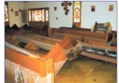
Wrath of Katrina: Overturned pews in Saint Nicholas Church shows devastation left by the storm. Reconstruction has begun.

It is greatly and sincerely appreciated, and they will be long remembered in the prayers of those who are the recipients of their exceptional charity."