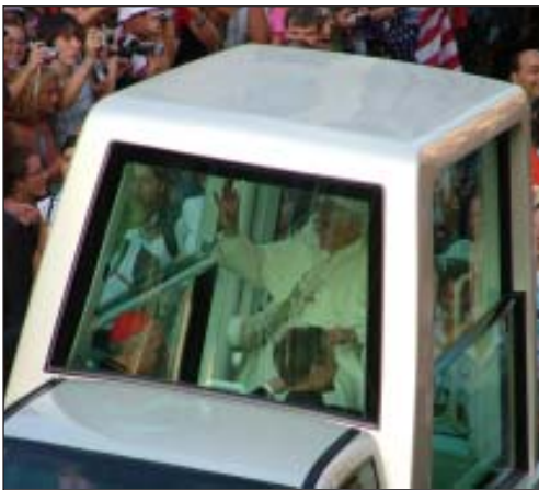
The Holy Father greets pilgrims in Germany for World Youth Day 2005.