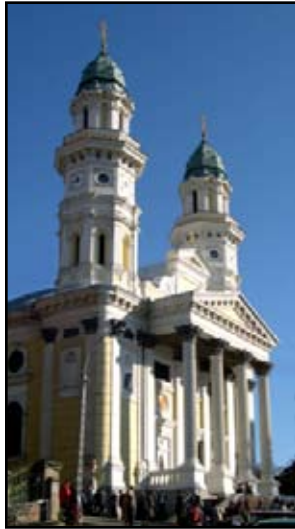
Cathedral of the Holy Cross, Eparchy of Mukachevo, Uzhorod