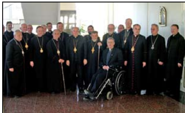
Hierarchs and Clergy were present representing Eparchies in Ukraine (Mukachevo), Eastern Europe, and America at Blessed Theodore Romzha Academy, Uzhorod